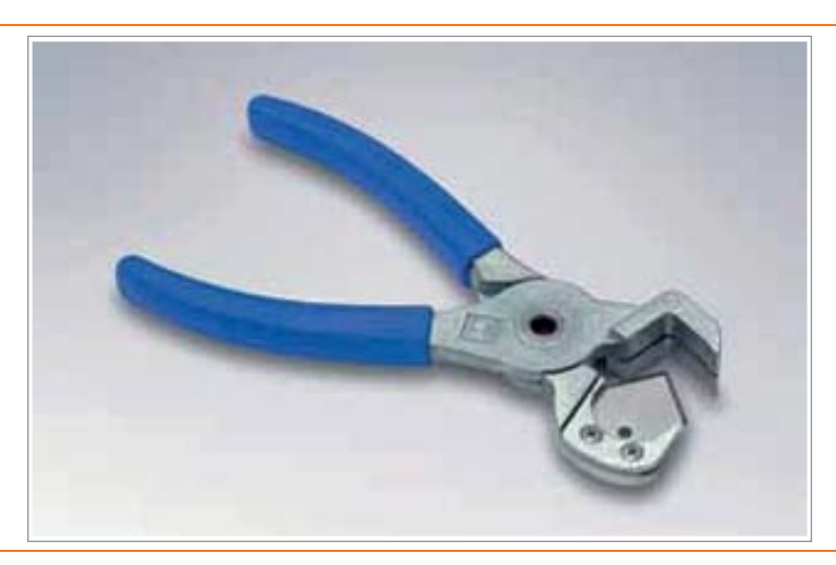
Fig. 5-3 Hose shears

Suitable hose shears can be ordered from FIBRO GMBH using order number 2480.00.54.03.