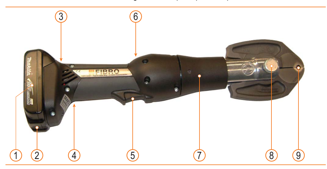
Fig. 3-1 Set-up

The illustration shows a schematic diagram of the principal set-up of the machine.