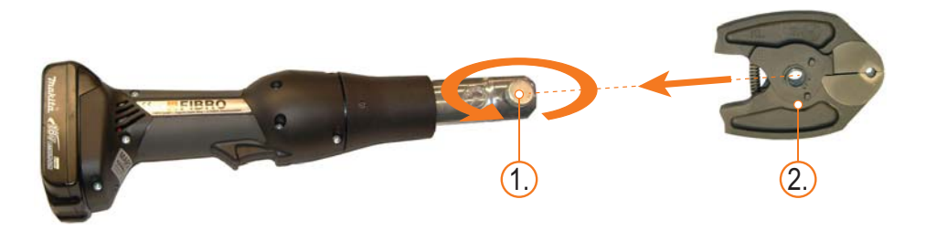
Fig. 5-2 Inserting the press tool